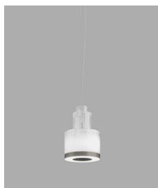
MEDEA SP 2